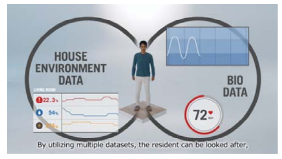
The services of emergency response, health monitoring over time and preventive care will utilize biodata and house environment data

The first step of our Platform House Concept is our effort for health as a theme. We divided health into 3 groups: emergency response, health monitoring over time, and preventive care, to provide services without causing any stress on the resident. For sudden onset diseases and conditions that threaten our lives, particularly those with a high likelihood of occurring at home (stroke, heart attacks, drowning in the bathtub, falling or fainting), early detection will lead to faster treatment that can have a huge impact on health.