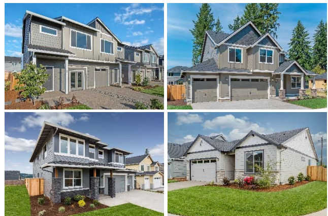
Detached Homebuilding Business Expansion Area